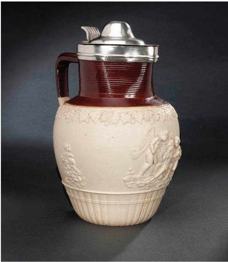
National Maritime Museum, Greenwich, London, Walter Collection http://www.nmm.ac.uk/collections/explore/object.cfm?ID=AAA4725